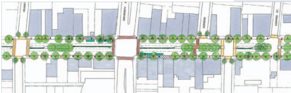
Proposed Improvements in the University Avenue Area