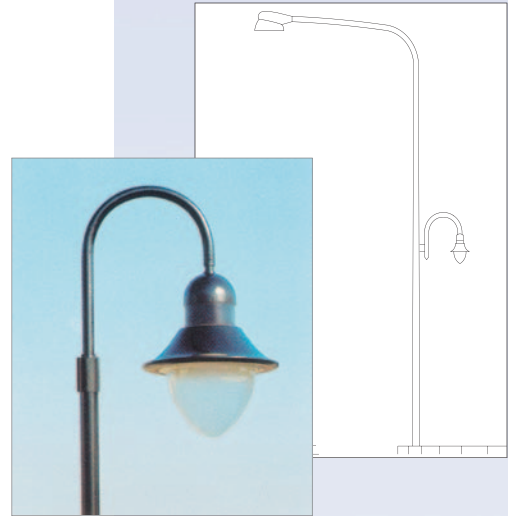
Proposed Pedestrian-scaled Light Fixture