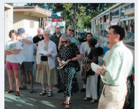
Stakeholders express their ideas and concerns during an AC Transit-sponsored Bus Tour