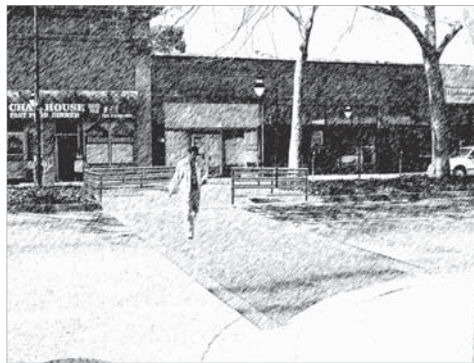
Proposed Pedestrian Crossing with Median 'Corral'