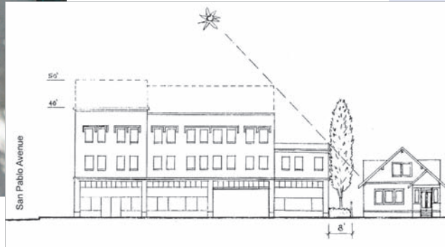
Introduce landscaped screens and buffers