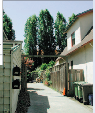
Screen of Trees as seen from adjacent residential property