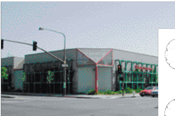
Lost opportunity for a corner building to enhance the public realm