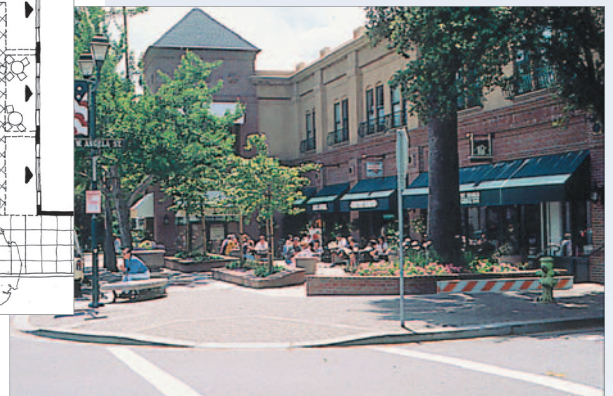
Example of a development that has realized the opportunity for incorporating a corner plaza