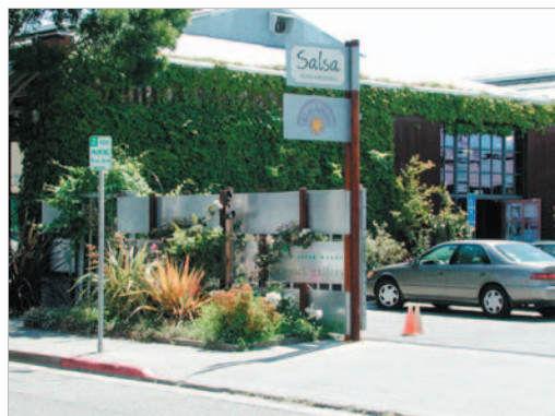
Parking facing onto public sidewalks should be screened from view with vegetation and artful screens or low walls